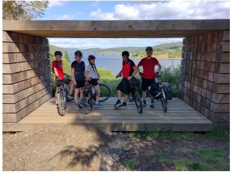
Bike ride around Kielder Water