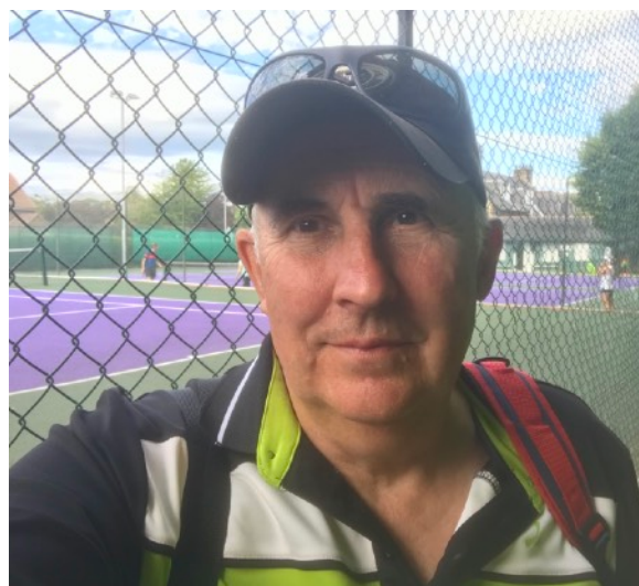
Ready for the next tennis match for Alnwick