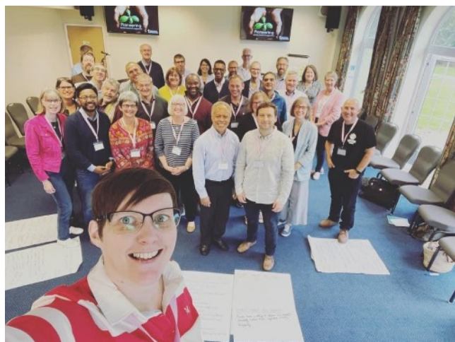
Baptist Union Core Leadership team and Pioneer Ambassadors