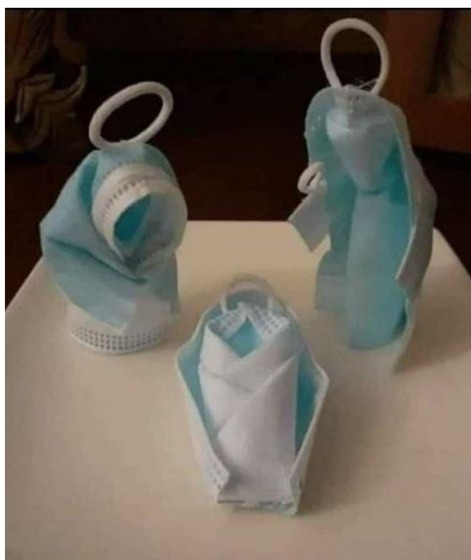
Contemporary nativity scene