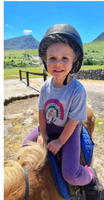
Lyra on Storm, Isle of Arran