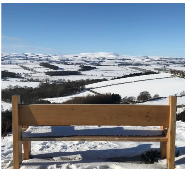
Looking towards the Cheviots from Corby Crag