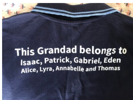
Grandad tee shirt