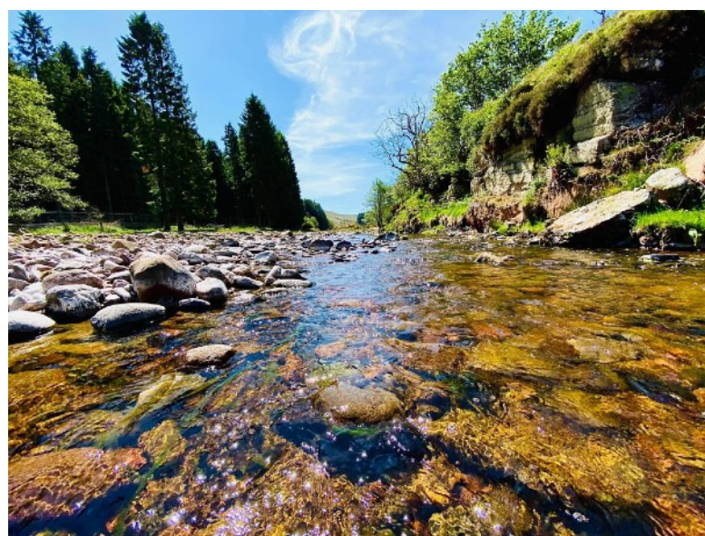
River Breamish, Ingram valley