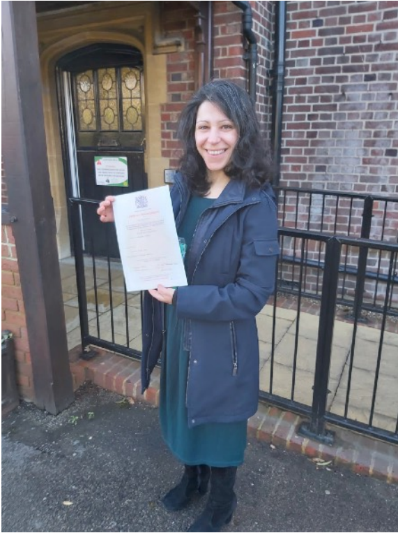
Varduyi - UK Citizen! 🙌👏