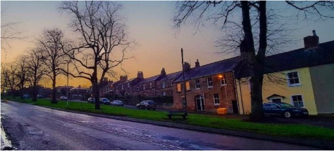
Grosvenor Terrace at dawn (the yellow one is ours)